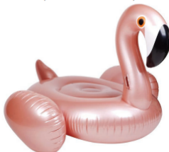
Rose Gold Flamingo (1 seater) $15 /charter