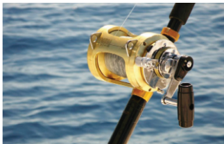
Fishing Equipment (Baits not included)