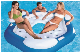
Floating Lounge (3 Seater) $30 /charter