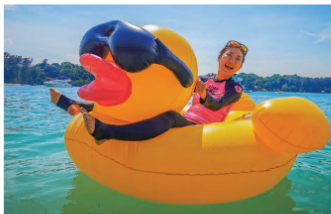
Yellow Rubber Ducky (1 Seater) $15 /charter