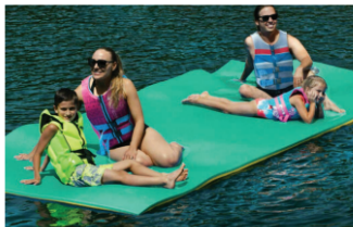
Floating Water Mat

For Lux 1 (3.5m * 1.5m) - - $40 /charter