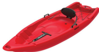
Additional Kayak Rental