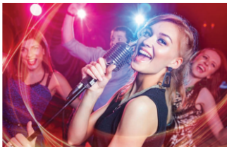
Karaoke Sound System Rental