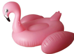
Pink Flamingo (1 seater) $15 /charter