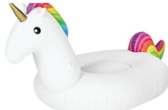
Giant Unicorn Float (1 Seater) $15 /charter