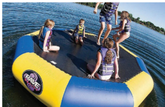
Inflatable Water Trampoline

For Lux 2 (5.5m * 1.83m) - - $60 /charter