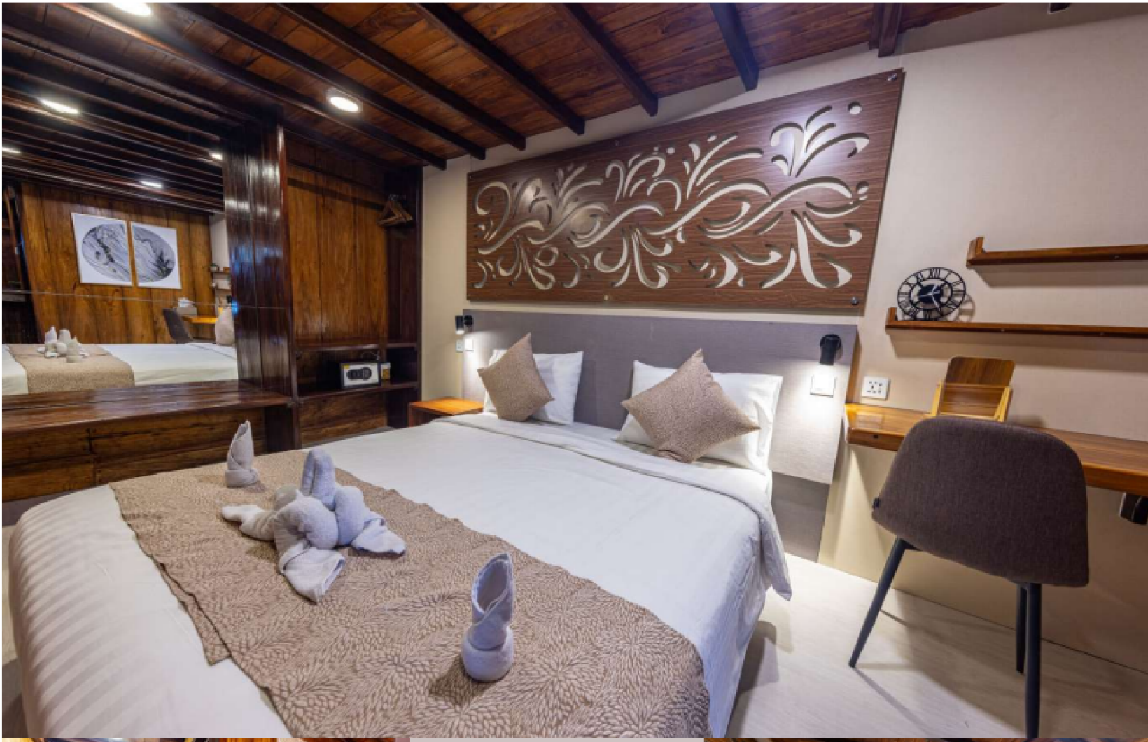
UPPER DECK TWIN SHARING CABIN