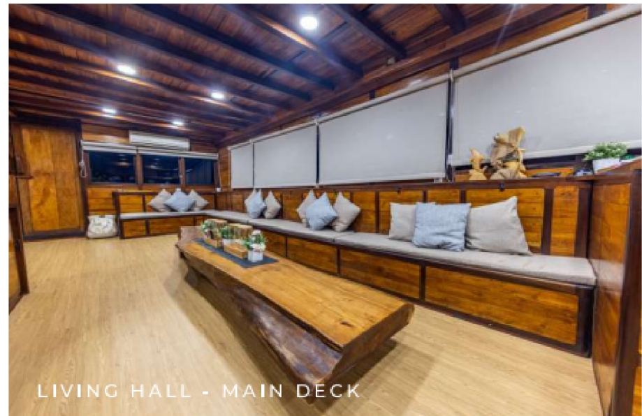
LIVING HALL - MAIN DECK