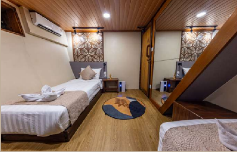
LOWER DECK TWIN SHARING CABIN