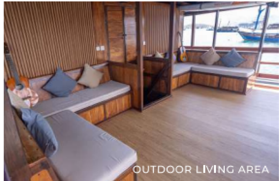
OUTDOOR LIVING AREA